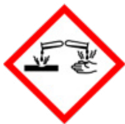
E - Corrosive

WHMIS Health Effects Criterial Met by this Chemical