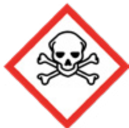
D2B - Toxic